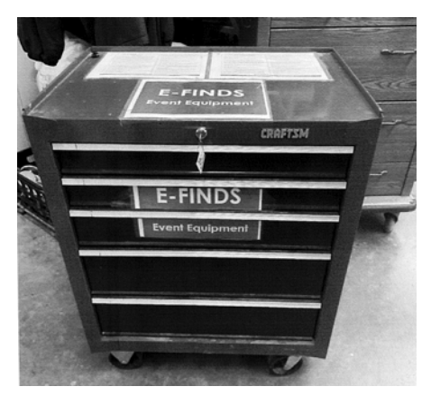
Photo: Disaster Supply Cart – St. Camillus Health & Rehab Center, Syracuse, NY